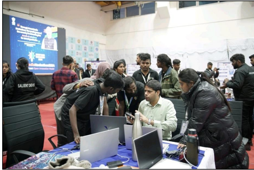
Fig: Smart India Hackathon Participation 2024