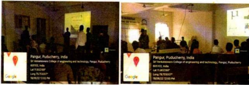
Students presenting their works in NEXUS-2022 A Research Activity on 18.06.2022