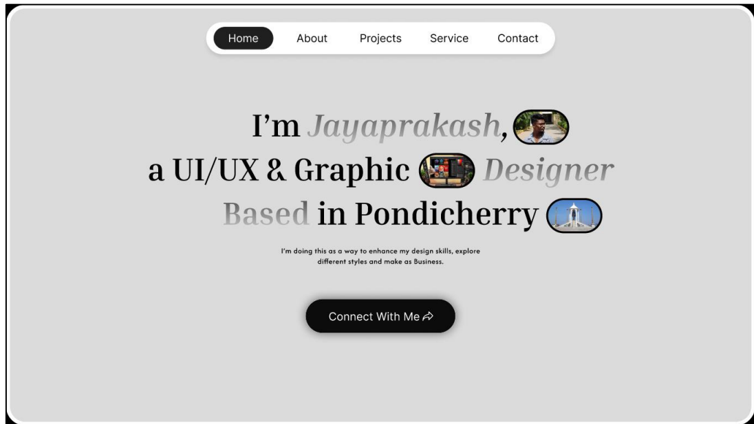
Fig: Students Created their Own Portfolio