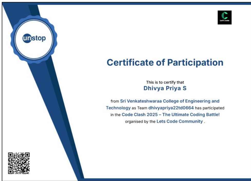
Fig: Code Clash Participation Certificate