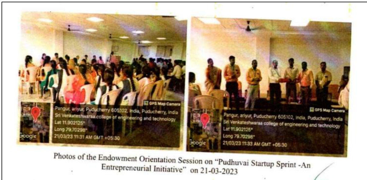
Photos of the Endowment Orientation Session on "Pudhuvai Startup Sprint -An Entrepreneurial Initiative" on 21-03-2023

The Institutions Innovation Council (IIC) is collaborated with Atal Incubation Centre Pondicherry Engineering College Foundation (AIC-PECF) to organize an Orientation Session on "Pudhuvai Start Up Sprint-An Entrepreneurial Initiative" the duration of the Event was 2 hours on 21.03.2023 at MBA Seminar Hall. The 80 Students of II Year and III Year of Engineering came up with the StartUp Ideas to develop Self-Employment and Job Opportunities.